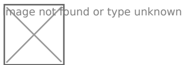
Screen 7: Field Types

With Extension extension, you get several field types that you can create based on your requirement. The following image shows the available field types.